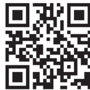
媒體報導 Media Coverage

In the 2024/2025 academic year, TWC will launch the first self-financing Bachelor of Science (Honours) in Medical Imaging in Hong Kong to meet the heavy demand for diagnostic radiographers. TWC has received HK$26.5 million from the Education Bureau's Enhancement and Start-up Grant Scheme for Self-financing Post-secondary Education (ESGS) to launch the new programme. The programme was accredited by the Hong Kong Council for Accreditation of Academic and Vocational Qualifications (HKCAAVQ) and approved by the Chief Executive-in-Council.