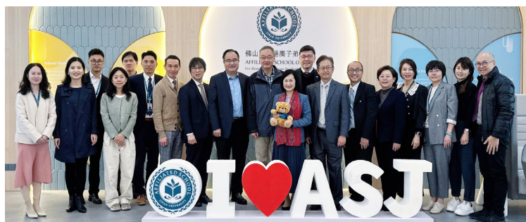
學院與廣州、東莞及佛山三所暨大港澳子弟學校簽署合作協議，於內地推行首個校長推薦計劃。

TWC signed MoAs with ASJ (Guangzhou), ASJ (Dongguan) and ASJ (Foshan), for the implementation of the first School Principals Nomination Scheme in mainland China.