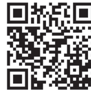
2023 年畢業生調查及其他學院發展 2023 Graduate Survey & More