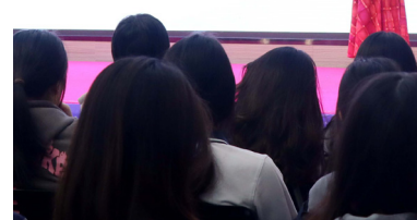
管理團隊到廣州及東莞兩所暨大港澳子弟學校出席宣講會，向五百名學生介紹學院及課程。The delegation visited ASJ (Guangzhou) and ASJ (Dongguan) to introduce TWC and its programmes to 500 students.