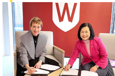
學院與西悉尼大學簽署升學銜接協議。 Signing of Articulation Agreement with Western Sydney University.