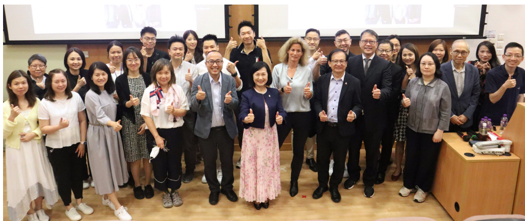
東華學院教職員出席是次研究工作坊及研討會。 TWC academic staff attended the research workshop and seminar.

Research Workshop and Seminar Co-organised by ARH and Mental Health and Wellbeing Theme Group