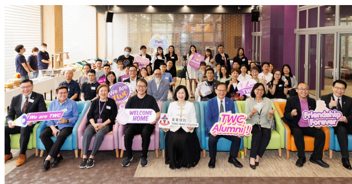
學院管理團隊、老師及校友見證校友會成立的歷史一刻。 The management team, teachers, and alumni of TWC celebrated the historic moment for the establishment of the TWCAA.