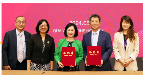
學院與泉州頤和醫院就教育培訓簽署合作協議。 The College signed an agreement with Quanzhou Yihe Hospital on professional training collaborations.