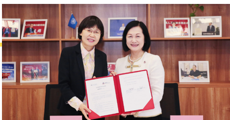
學院與北京外國語大學簽署合作備忘錄。 MOU Signing Ceremony with Beijing Foreign Studies University.