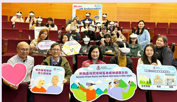
團隊除於多個院舍推行 VR 遊戲項目，研究計劃亦已於 ClinicalTrials.gov 平台註冊，並發表在 Trials 期刊上。

needs (SEN), as mental health parent ambassadors. The project results showed parents had improved their self-efficacy, self-compassion, appreciation of children and strengths. They had increased help seeking behaviour from mental health professionals and peer parent ambassadors. Together with professionals, the parent ambassadors have built a stigma-free support platform to provide resources for parents with SEN children.