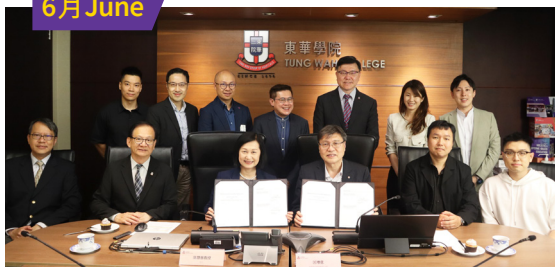
學院與廣州涉外經濟職業技術學院就升學銜接簽署合作協議。 The College signed an articulation agreement with Guangzhou International Economics College.