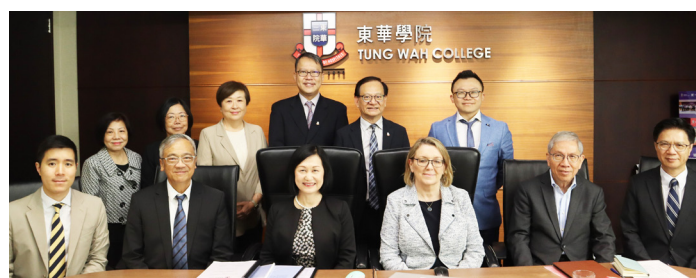
評審局的評審小組於 5 月 7 日至 9 日為生物科學學科範圍進行學科範圍評審實地考察。

TWC has successfully completed the Programme Area Accreditation by the Hong Kong Council for Accreditation of Academic and Vocational Qualifications (HKCAAVQ) for the Programme Area of Biological Sciences at Qualifications Framework (QF) Level 5 in August 2024. The College offers three programmes in the Programme Area of Biological Sciences at QF Level 4 to 5, including the Bachelor of Science (Honours) in Biomedical Science, Bachelor of Science (Honours) in Forensic Biomedical Science, and Higher Diploma in Health Science programmes. The successful accreditation of the second Programme Area following Occupational Therapy reflects the full external recognition of the College's academic programme quality.