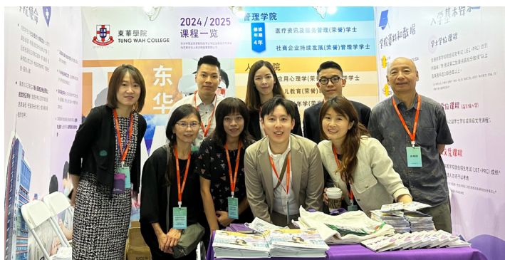
各學院及內地及國際事務部代表參與展覽，與現場的家長及學生交流。 Representatives from Schools and the Mainland and International Engagement Division (MIED) participated in the Expo to facilitate communications with parents and students on site.