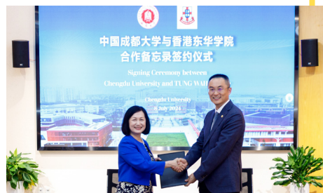
學院與成都大學簽署合作備忘錄。 MOU Signing Ceremony with Chengdu University.

Fourteen students and teachers from the Nursing and Applied Gerontology programmes were sponsored by the Youth Development Commission to join an exchange programme in Chengdu, Sichuan.