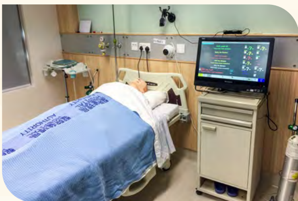
挑戰導向學習護理實驗室 Challenge Based Learning Nursing Laboratory