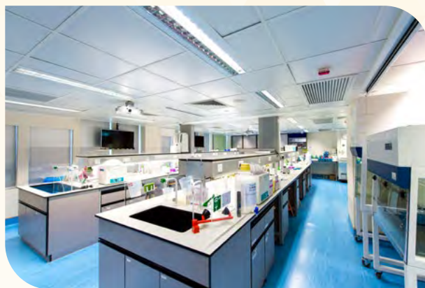
醫療科學實驗室 Medical Science Laboratory