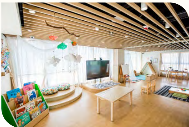
幼兒教育實驗室 Early Childhood Education Simulation Laboratory