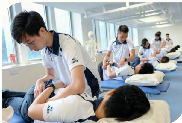
物理治療實驗室 Physiotherapy Laboratory