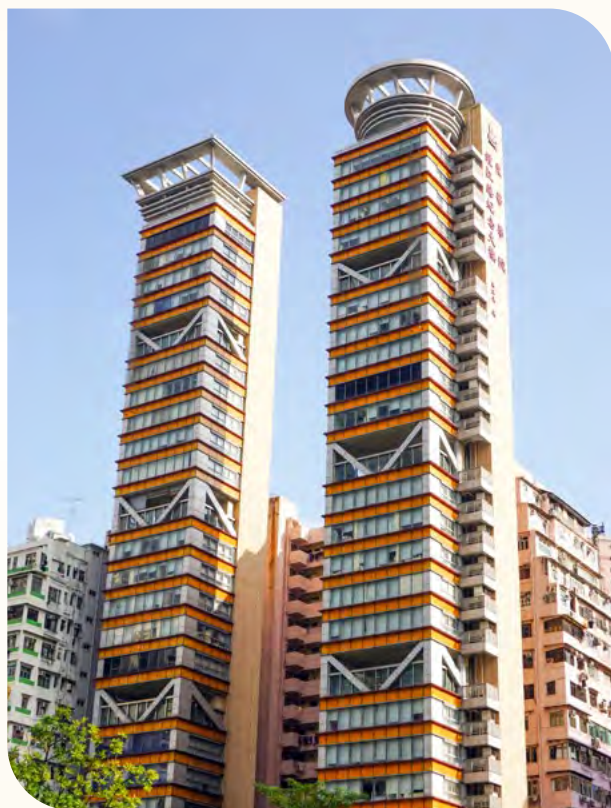
旺角校舍 Mongkok Campus