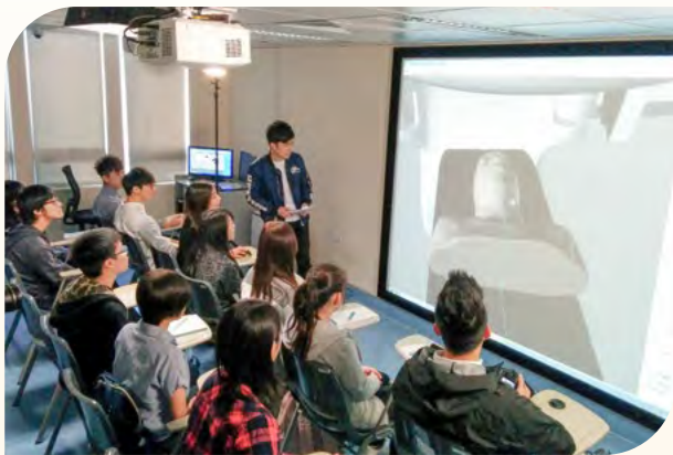
放射治療實驗室 Radiation Laboratory