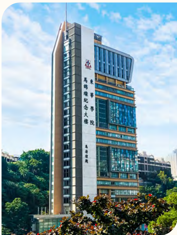
京士柏校舍 King's Park Campus

TWC endeavors to create a quality and conducive learning environment. Located in King's Park, Mong Kok and Kwai Hing, TWC campuses are furnished with advanced teaching and learning facilities. The laboratories and simulation equipment are of industry standard to give students hands-on training in related professions.