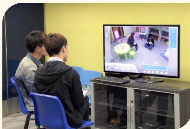
應用心理學實驗室 Applied Psychology Laboratory