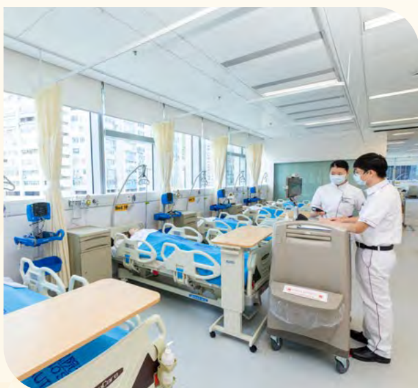
葵興校舍 Kwai Hing Campus