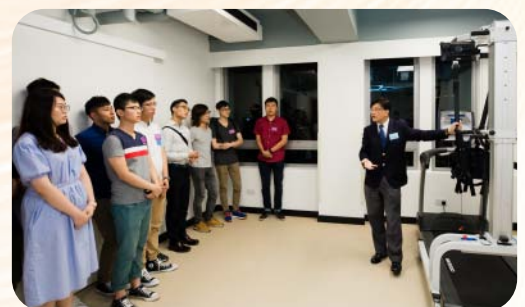
校友參觀學院先進的教學設備及實驗室感興奮。 The alumni are impressed by the new Physiotherapy Laboratories in the campus.