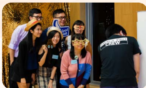
校友享用即影即有拍照服務，留下美好回憶。 Alumni enjoy instant photo taking services to capture the unforgettable moments.