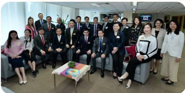
東華三院董事局參觀圖書館。 TWGHs Board of Directors visits the Library.