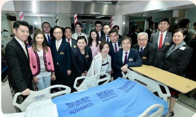
東華三院董事局參觀挑戰導向學習護理實驗室。 TWGHs Board of Directors visits Challenge Based Learning Nursing Laboratory.

TWGHs Board of Directors visited TWC on 19 April to keep them updated of the latest development of the College.