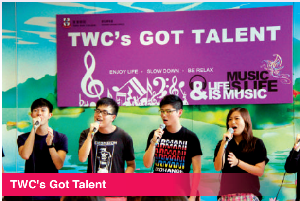
TWC's Got Talent