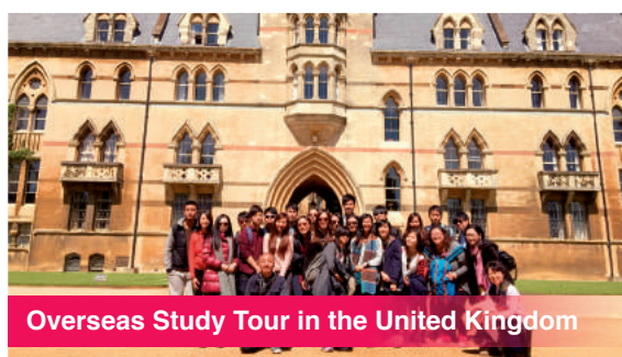
Overseas Study Tour in the United Kingdom