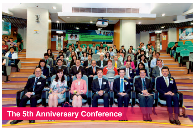
The 5th Anniversary Conference