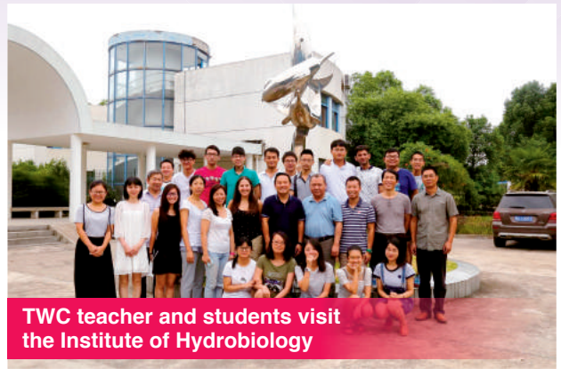
TWC teacher and students visit the Institute of Hydrobiology