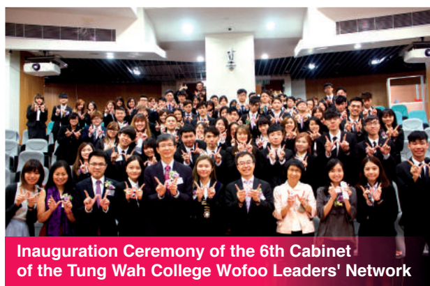
Inauguration Ceremony of the 6th Cabinet of the Tung Wah College Wofoo Leaders' Network