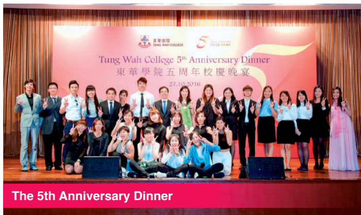
The 5th Anniversary Dinner