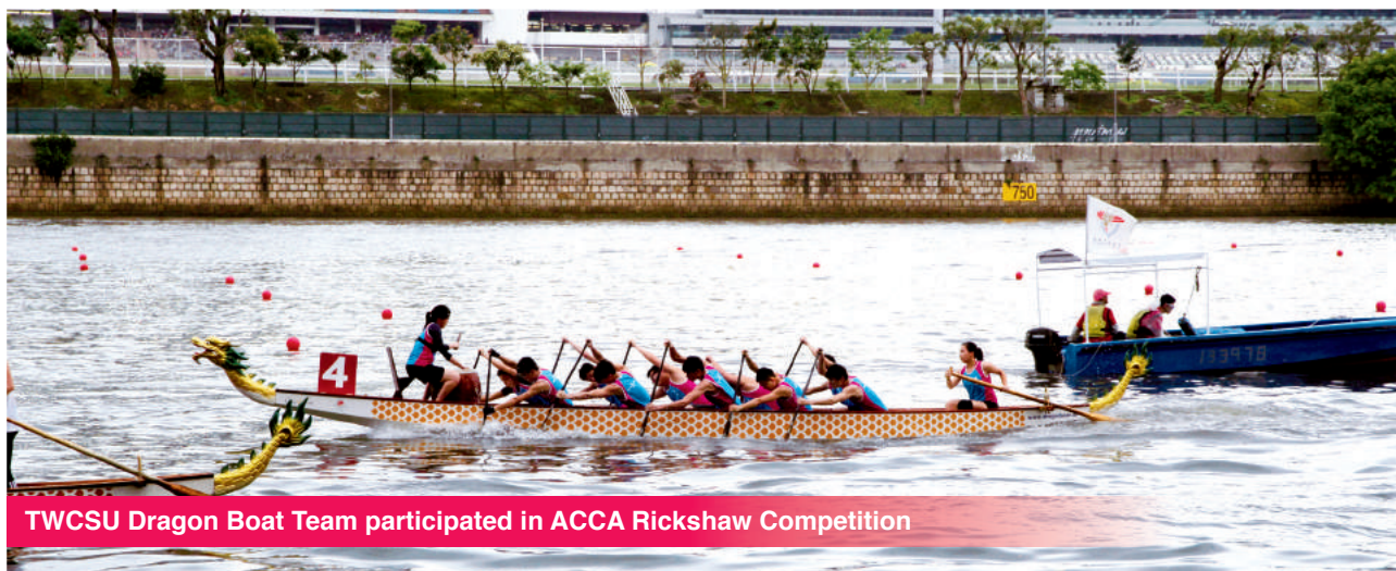
TWCSU Dragon Boat Team participated in ACCA Rickshaw Competition