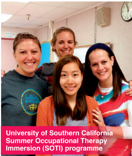
University of Southern California Summer Occupational Therapy Immersion (SOTI) programme