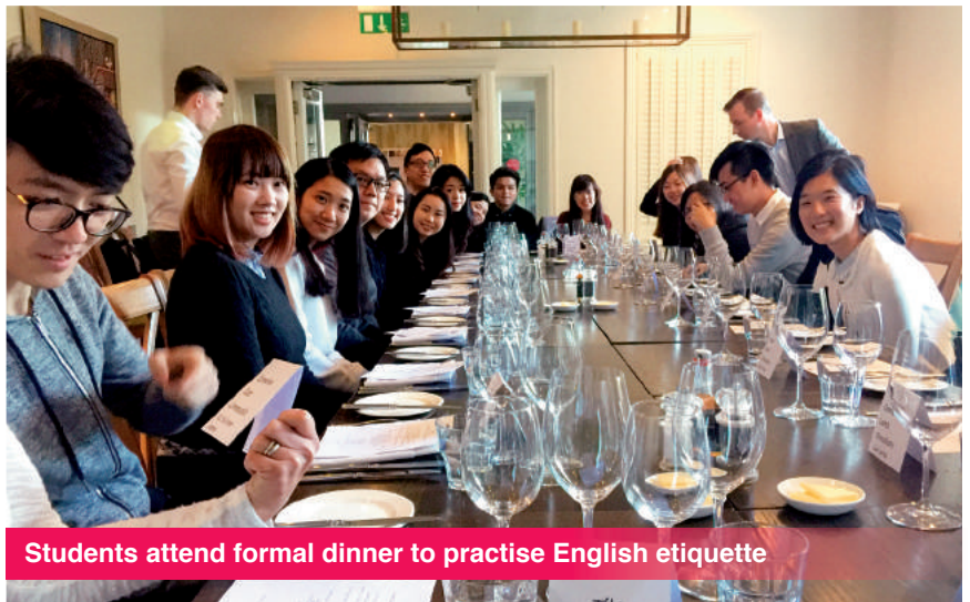
Students attend formal dinner to practise English etiquette