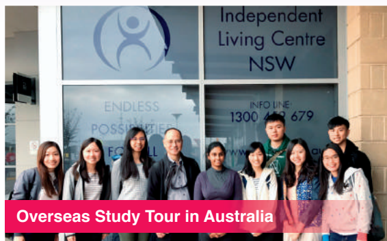
Overseas Study Tour in Australia