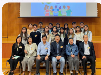
同學和導師們於2021年11月12日舉行的GLAP聚餐上，首次認識大家。 The kick-off event of the programme named GLAP Gathering was held on 12 November 2021 to welcome all participating students and mentors.

A variety of training activities have been conducted in the past few months, including the GLAP Advancement Training Camp, Life Engagement Workshops, Social and Global Awareness in Action, etc. Mentoring session is also a very significant component of the programme. With the continuous guidance and support provided by the mentors, students can gain valuable experiences and advice to face their difficulties in life, know more about their inner self and learn to be a better person and a strong future leader.