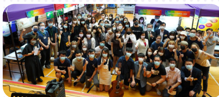
學生迎新日為同學提供實用資訊及各種精彩活動。 Useful information and activities were provided to students.