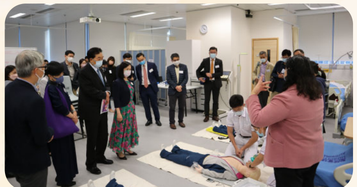
自資高等教育聯盟會代表團參觀護理學、醫療科學及物理治療實驗室。The delegation paid a visit to the nursing, medical science and physiotherapy laboratories.