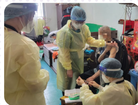
「疫苗易」家居接種計劃。 Door-to-Door Vaccination Service.

第五波新冠疫情下，東華學院（學院）師生各展所長，積極走到最前線分擔抗疫重任，以專業護理知識回饋社會。