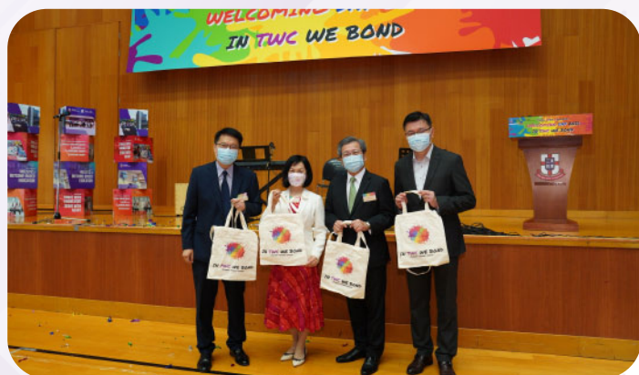
學生事務處製作精美布袋作紀念品。 The tote bag as souvenir presented by Student Affairs Office.

學生迎新日2021於9月9日及10日於京士柏校舍馬錦燦紀念大樓20樓禮堂順利舉行，由校長陳慧慈教授、副校長（行政及拓展）梁鏡威先生及學生事務長劉國偉先生一同主持開幕儀式。是次活動共有725名學生參與，參觀19個由不同學生組織及學院部門設置的攤位，深入了解不同學生組織、學生舉辦的活動、學院對同學的支援，以及學院未來發展等，以加強對學院的認識和歸屬感。