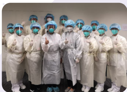
東華學院師生進駐啟德暫託中心照顧確診長者。 TWC teachers and students provide healthcare services to the elderly patients in Kai Tak Holding Centre.

學院亦於不同崗位協助抗疫工作，如派出約50名師生，參與香港社會服務聯會及香港醫學組織聯會的「疫苗易」家居接種計劃，上門為行動不便的長者及殘疾人士接種疫苗；為護理人員進行「N95 呼吸器的面型配合測試」(Fit testing) 及呼吸器配戴訓練，協助提升其防護能力；與非牟利機構推出免費網上中醫診症服務，為合資格長者提供視像會診及提供中藥；及支援醫院管理局聯網醫院化驗室工作等。