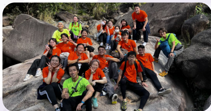
同學們在入營的第二天一起走過馬大石澗。雖然路線非常有挑戰性，途中亦遇到不少困難，但他們最終憑着堅毅的意志和互相幫助，完成了整個旅程。 Students walked through the Ma Tai Stream together on Day 2 of the Advancement Camp. Although they encountered many difficulties along the route, they all completed the journey successfully with perseverance and mutual support.

環球領袖發展計劃是一個專為東華學院學生而設的發展及培訓計劃。此計劃旨在透過不同的活動，加強學生與自己和他人的關係，擴闊他們的本地與國際視野，並挑戰自我界限，發掘、了解及學習更多知識、概念和實用的軟技能，從而活學活用，貢獻社會。計劃在過去幾個月舉行了不同的訓練活動，包括訓練營、生命參與工作坊、本地及環球意識工作坊等，而每月一次的指導面見更是整個計劃非常重要和不可或缺的一環。透過導師們的指導和支持，同學們可以獲取寶貴的經驗和建議，從而正確面對生活中的困難，使他們更認識自己，學習成為一個更好的人和出色的未來領袖。