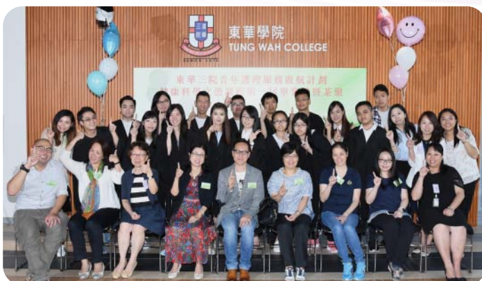
健康科學文憑課程第一屆畢業禮於2018年10月6日舉行，畢業生與嘉賓合照。 The 1 st Graduation Ceremony of Diploma of Health Studies was held on 6 October 2018.

東華三院青年護理服務啟航計劃（「青航計劃」）健康科學文憑課程第一屆畢業禮於2018年10月6日舉行，東華三院署理社會服務總主任何玉眉女士頒發畢業證書予22位畢業生。「青航計劃」健康科學文憑課程自2016年開始由東華三院社會服務科及東華學院合辦，以回應護理及安老服務人手短缺的訴求，學員畢業後可註冊為保健員（資歷架構級別 3），投入業界服務或繼續升學。