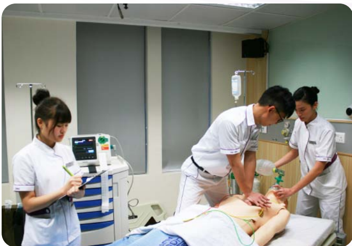
模擬護理實驗室設置成真實病房的环境，讓學生實踐護理技巧。 Students practise their nursing skills in a simulation laboratory.

To cater to the expansion needs of our nursing programmes, TWC is establishing the new Kwai Hing Campus at the conveniently located Kowloon Commerce Centre (KCC) near Kwai Hing MTR Station. It is scheduled to commence operation in September 2019.