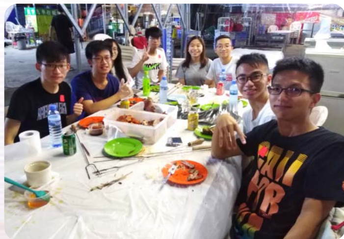
「學長計劃2018」燒烤聚會。 BBQ gathering of “Peer Mentorship Programme 2018”.

“Peer Mentorship Programme 2018” organised by Student Affairs Office aims to provide peer support to new students and help them develop their personal networks at TWC. 11 senior year students and 54 new students join the Programme this year. Orientation lunch gathering, mentor training workshop and BBQ gathering were held in Semester 1 of 2018/2019.