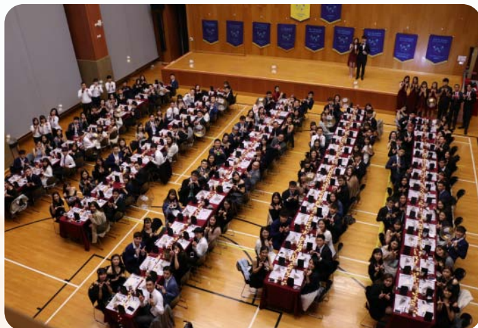
全體嘉賓和參與者大合照。 Group photo of all guests and participants.