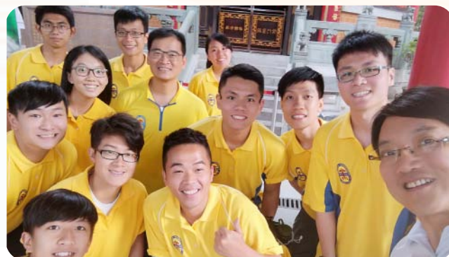
物理治療學學生參與世界物理治療日的義務工作。 Physiotherapy students join the World Physiotherapy Day.

Physiotherapy students volunteered for the World Physiotherapy Day – Hong Kong Stop on 8 September 2018. The event was organised by Hong Kong Physiotherapy Association with the aims of increasing public's awareness on physiotherapy services and health issues. Through their participation, the students had a deeper understanding of the service scopes of physiotherapists and experienced their dedication to the profession.