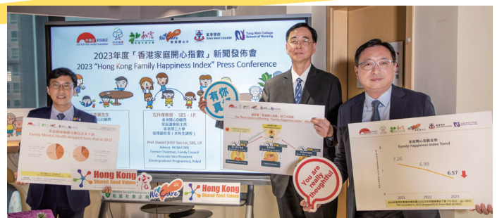
「香港家庭開心指數」新聞發布會。 “Hong Kong Family Happiness Index” Press Conference.

The family happiness index survey results showed that the happiness has hit a three-year low, with a score of just index 6.57 out of 10. The proportion of respondents who reported that their family is unhappy