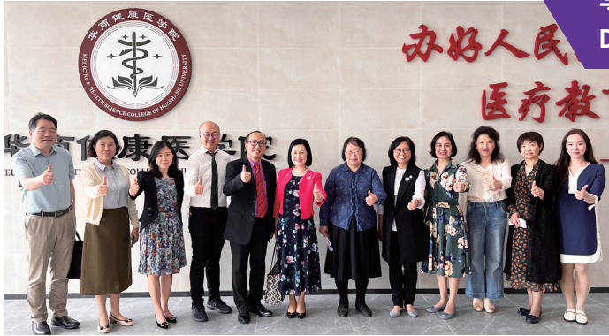
學院訪問團參觀華商學院的健康醫學院。 The delegation visited Huashang and toured their Medicine & Health Science College.

學院訪問團於 2023 年 4 月及 6 月先後到訪廣州及江門，與當地院校管理層會面，就課程發展、老師培訓、學生實習及交流進行多方面交流。