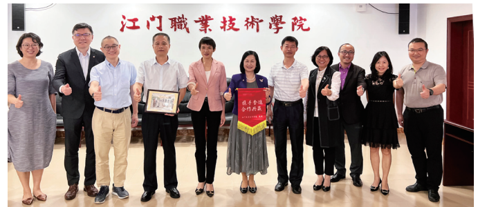
學院與江門當地學院及醫院計劃稍後簽訂合作備忘錄，以進一步鞏固夥伴合作關係。 MoUs are being planned to further strengthen the College's partnerships with schools and hospitals in Jiangmen.

The TWC delegation paid a visit to Guangzhou and Jiangmen in April and June 2023, and met with the management of the Schools to exchange views on programme development, teacher training, and student internships and exchanges.