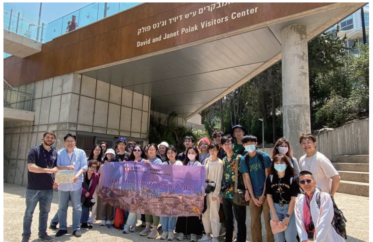
同學參觀以色列理工學院。 Students visited the Technion - Israel Institute of Technology.

The Global Leadership & Advancement Programme (GLAP) Study Tour to Israel is one of the most important components of the programme. It was designed to act as a powerful catalyst for effective global leadership development. By travelling to Israel during 21 to 28 May 2023, a country that is striving hard to empower herself through various means, 22 students had chances to have multiple, substantive, and intentional encounters to understand global issues from a variety of perspectives. Students also collaborated with their teammates and other stakeholders to learn to address global challenges and issues.