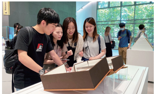
同學參觀當地城市、博物館及特色建築。 Students visited local cities, museums, and characteristic architectures.