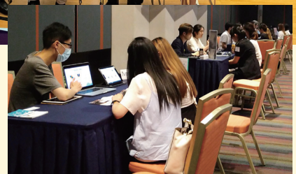
學生出席香港科技園的展示日，與多間創科公司互動，了解科技產品的應用。 Students attended the HKSTP Showcase, interacted with a number of innovation and technology companies, and learned about Gerontech applications.