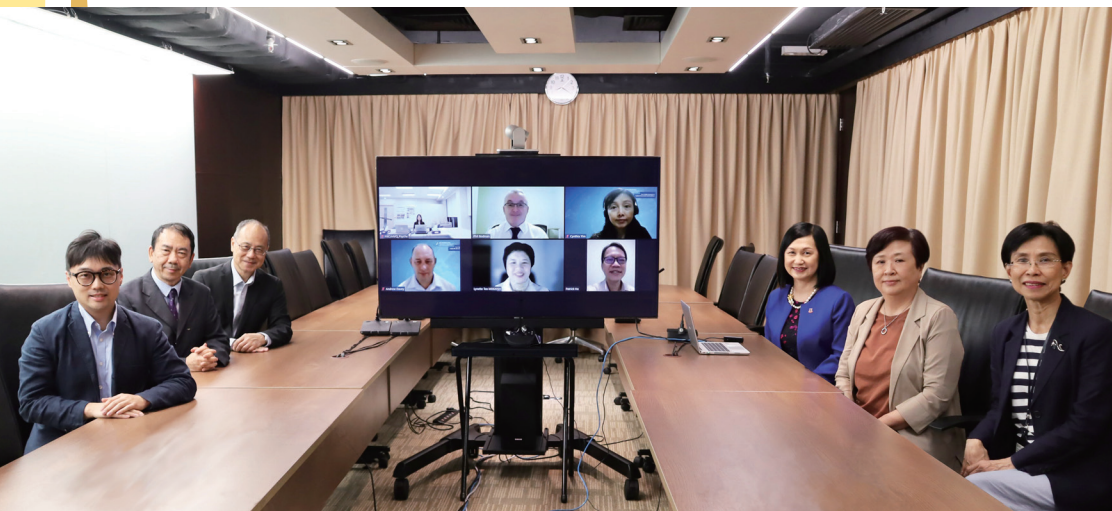
評審局的評審小組於 2023 年 4 月 20 及 21 日為醫療影像學（榮譽）理學士課程進行評審。 The HKCAAVQ's Accreditation Panel conducted the Learning Programme Accreditation for the Bachelor of Science (Honours) in Medical Imaging programme on 20 and 21 April 2023.

學院的醫療影像學（榮譽）理學士課程屬資歷架構第五級的課程，成功通過香港學術及職業資歷評審局（評審局）的評審。待行政長官會同行政會議批准後，此課程期望於 2024 年 9 月開辦。