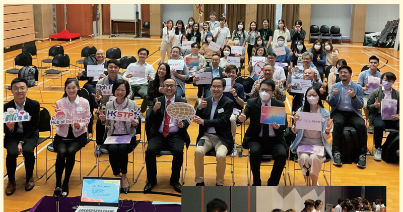
香港科技園及創科公司於2023年3月21日到訪學院，應用老年學學生向嘉賓分享他們對樂齡科技的見解。HKSTP and the Gerontech developers visited TWC on 21 March 2023. Applied gerontology students shared their views on Gerontech with the guests.

Hong Kong Science & Technology Parks Corporation (HKSTP) collaborates with TWC's Bachelor of Science (Honours) in Applied Gerontology programme to pioneer a Gerontech stream in the summer internship in this academic year to set up the “TWC AG x HKSTP” internship programme. With the trend of driving elderly and rehabilitation service development with Gerontech, it is believed that equipping our students with the mindset and knowledge of Gerontech adoption will definitely elevate their professional career development to the next level. Prior to the launch of the internship programme in early July 2023, there was a visit-cum-exchange by HKSTP and the Gerontech developers at TWC on 21 March, and a showcase conducted at HKSTP on 29 May.