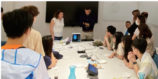
同學在旅程的第四天參觀初創企業 MeMed，首次認識和接觸一部由企業所研發的機器 Memed BV®，其高靈敏度能夠快速區分細菌和病毒。 The students visited the start-up company MeMed on Day 4 of the journey, and were introduced to the Memed BV®, which was a rapid and highly sensitive machine developed to distinguish bacteria and viruses.