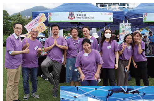
「東華學院健康站」攤位。 "TWC Health Station".

TWC was invited to participate in the "Yau Tsim Mong Wellness Gala" co-organised by the Yau Tsim Mong District Office and GDCC Association Limited on 6 May 2023. Over 50 teachers and students from TWC set up a "TWC Health Station" at the Art Park of West Kowloon Cultural District to provide health check-ups, psychological health assessments, and workshops to the public to promote the messages of healthy body-mind-spirit.