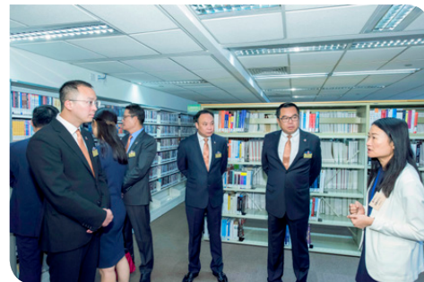
東華三院董事局參觀圖書館。 TWGHs Board of Directors visits the Library.