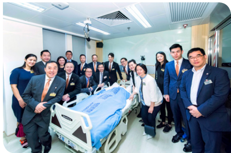
東華三院董事局參觀挑戰導向學習護理實驗室。 TWGHs Board of Directors visits Challenge Based Learning Nursing Laboratory.

TWC arranged a visit for TWGHs Board of Directors on 31 May in order to strengthen their bonding with TWC and keep them updated about the latest development of the College.