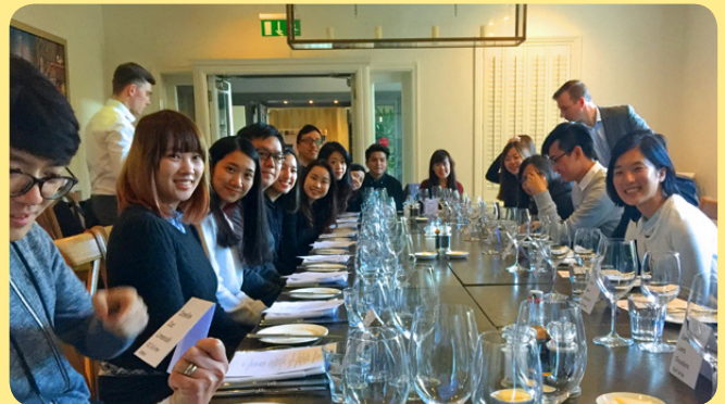
學生參與英式正統晚宴，練習社交禮儀。 Students attend formal dinner to practise English etiquette.

Business administration and nursing students attended seminars and lectures given by local teachers on history, literature, culture and etiquette. The students also joined field trips, excursions and social activities, through which they could interact and exchange with local and international students in the UK.