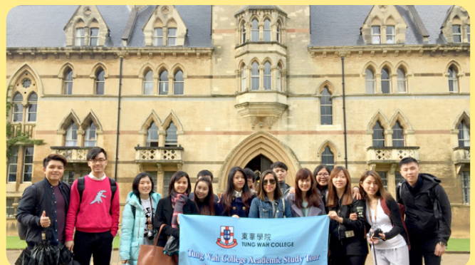
參觀世界頂尖大學 - 牛津大學。 Visit of University of Oxford.