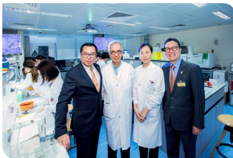
東華三院董事局參觀醫療科學實驗室。 TWGHs Board of Directors visits Medical Science Laboratory.