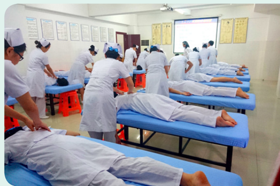
考察團參觀的廣西醫科大學護理學院，實驗室設備模擬實際醫院情況，讓學生熟悉實習環境。 The Group visits the School of Nursing of Guangxi Medical University. The laboratories are set based on actual hospital setting to let students familiarise with clinical environment.