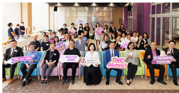
學院管理團隊、老師及校友見證校友會成立的歷史一刻。 The management team, teachers, and alumni of TWC celebrated the historic moment for the establishment of the TWCAA.