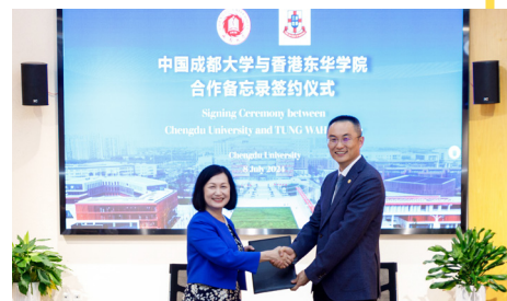
學院與成都大學簽署合作備忘錄。 MOU Signing Ceremony with Chengdu University.

Fourteen students and teachers from the Nursing and Applied Gerontology programmes were sponsored by the Youth Development Commission to join an exchange programme in Chengdu, Sichuan.