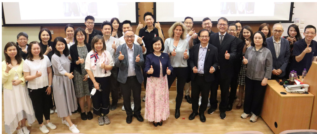
東華學院教職員出席是次研究工作坊及研討會。 TWC academic staff attended the research workshop and seminar.

Research Workshop and Seminar Co-organised by ARH and Mental Health and Wellbeing Theme Group