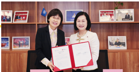
學院與北京外國語大學簽署合作備忘錄。 MOU Signing Ceremony with Beijing Foreign Studies University.