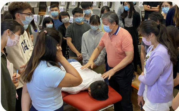
參加者對講者的示範深感興趣。 Participants showed high interest in speaker's skill demonstration.

Two Occupational Therapy workshops for practitioners were held at Viola Y.W. Man Chan Lecture Theatre, King's Park Campus on 5 and 12 June 2021 respectively. Experienced speakers were invited to share their experience and demonstrated skills in vestibular therapy and OT assessment and intervention on functional vision to enhance occupational performance. On-site practice on taught skills was arranged for participants to apply practical skills and to enhance their theoretical knowledge. The workshops reached out to occupational therapists working in various settings, including NGOs, special schools, private settings and Hospital Authority, providing a platform for cross-setting sharing and interaction.