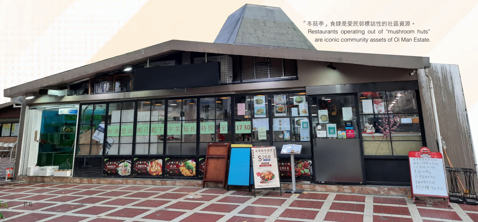
「冬菇亭」食肆是愛民邨標誌性的社區資源。 Restaurants operating out of "mushroom huts" are iconic community assets of Oi Man Estate.