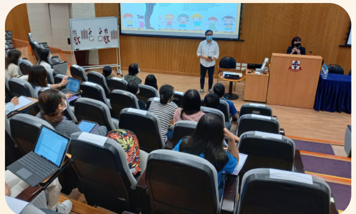
參加者積極發問及互相討論交流。 Participants were active in asking questions and sharing ideas in open discussion.