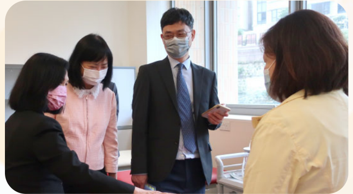
教育局代表在物理治療實驗室聆聽儀器運用講解。 EDB representatives were given an introduction of the use of equipment in the physiotherapy laboratory.