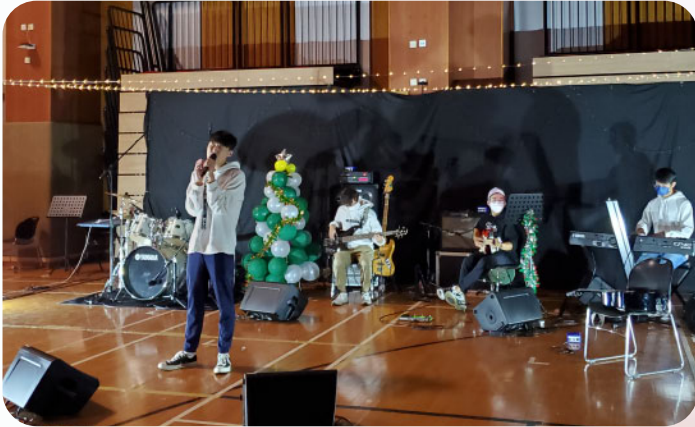
學生歌曲獨唱。 Solo singing of a student.

To celebrate the 10th anniversary of Tung Wah College, the College and the Music Society co-organised the TWC 10th Anniversary Online Music Concert in the hall on the 20/F of Ma Kam Chan Memorial Building on 23 December 2020. The concert featured solo singing, guitar and piano playing, and a band show. Over 1,000 students and staff joined it online and had an enjoyable evening.