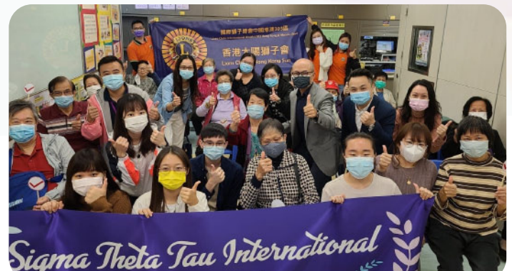
「流感與新冠病毒」健康講座吸引多名長者參加。 The health talk on Flu and COVID-19 enjoys good response from the elderly.