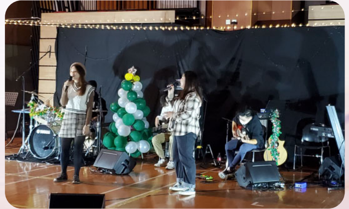
學生合唱。 Student team singing.