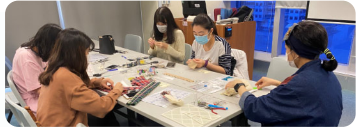
紮染工作坊。 The tie-dye workshop.

The first cabinet of TWC Students' Union Art Society 'Fantasia' was established in October 2020. By organising different types of activities, the Society becomes a platform for students to participate in art creation and allows them to have a deeper understanding of art. Since its establishment, the Art Society has organised workshops on making dream catchers, handmade candles, Christmas wreaths as well as tie-dye, attracting many students to join.