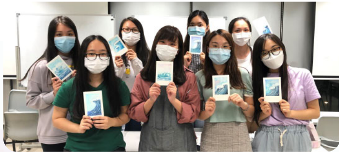
第一屆東華學院學生會藝術學會「Fantasia」正式成立。 The first cabinet of TWC Students' Union Art Society 'Fantasia' has been established.

第一屆東華學院學生會藝術學會「Fantasia」於2020年10月正式成立，學會透過舉辦不同類型的活動，成為同學的藝術創作平台，加深同學對藝術的瞭解。藝術學會成立至今舉辦了多個工作坊，內容涵蓋製作捕夢網、手工蠟燭、聖誕花圈及紮染，吸引不少同學參加。