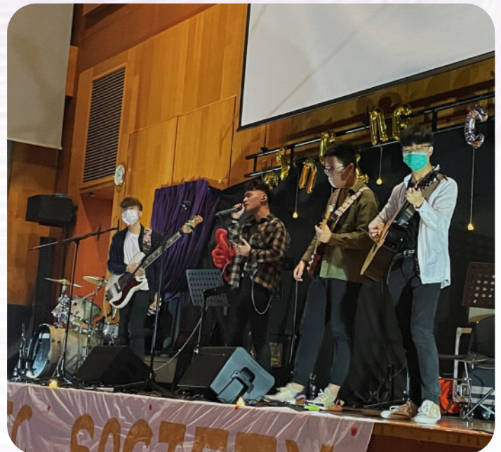
同學賣力獻唱。 The students give a dazzling performance.

關注音樂學會「韶風」專頁以獲得最新資訊： Follow Music Society 'Zephyr' on social media: