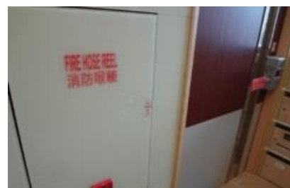
Break glass alarm and Hose Reel