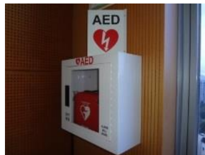
Four AED are placed at King's Park Campus (G/F FMO and 20/F Hall) and Mongkok Campus (1/F FMO in Towers A and B).